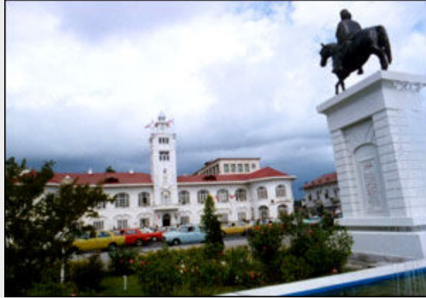
Municipality of Rasht and statue of "Mirza Kouchek Khan-e Jangali"

The people of Rasht played a very important role in the Constitutional Revolution. Russian and British army as well as local rebels attacked Rasht City during the World War I (1914-1918). In 1920, Rasht became the arena of revolutionary movements again. When the Red Army conquered Baku in 1918, the navy of White Army took asylum in the Anzali Port, which was under control of British army. The