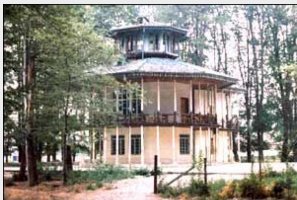
"Kolah Farangi" building